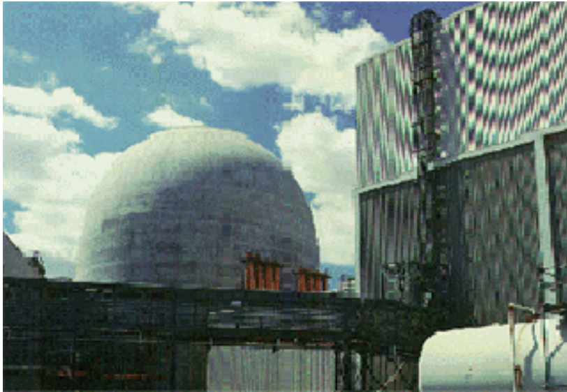
Remote Robotic Probe inspects pipes and other hard-to-access gear at electric power generating stations. Windows NT was chosen as the operating system software.

In a world where downtime is measured in thousands of dollars per minute, quality and reliability are priceless. That is why system designer Foster Miller of Waltham, Massachusetts chose Opto 22 hardware and software to control their robotic inspection vehicles.