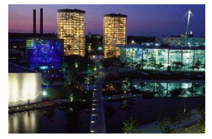
Figure 1: The Wolfsburg . Germany Autostadt

For the Wolfsburg Autostadt, SKN designed and planned an Opto 22 hardware integration project, combining Opto 22 remote monitoring, control, and data acquisition systems with the Windows based Prisma software. "We wanted to use Ethernet-based hardware due to the fact that there was already an existing Ethernet network in