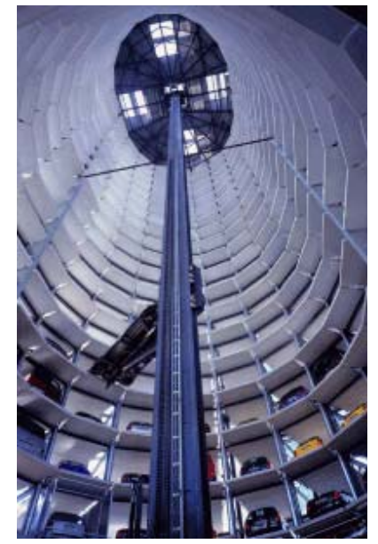
Figure 3: At Autostadt, taking ownership of your new car is an event in itself. In a fully automated procedure, your car is brought down to you from a 20-story car tower.