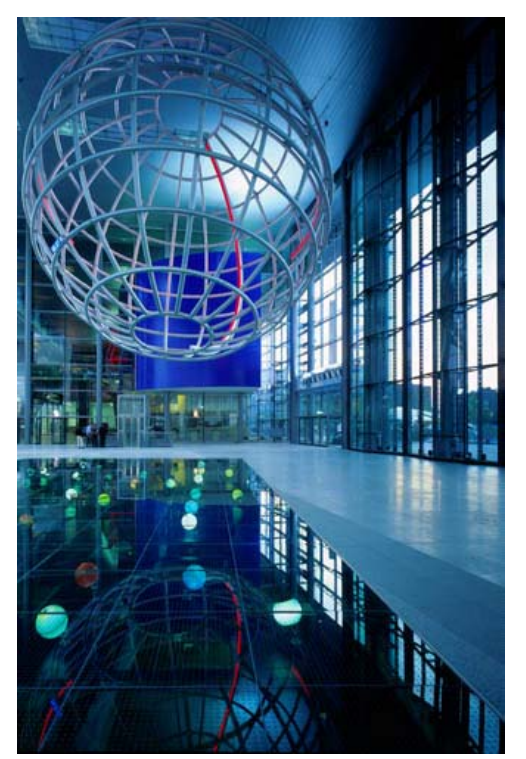
Figure 2: The Volkswagen Building

SNAP Ethernet I/O also enables remote monitoring of Autostadt restroom facilities. Throughout the Autostadt, the men's and women's bathrooms are equipped with alarm buttons should a toilet become disabled or other emergency situation occur. When activated, the alarm system sends an alert to the SNAP Ethernet system, which then generates and communicates back to the Prisma software at the control station. Once this alarm is received from the SNAP Ethernet system, a maintenance technician is immediately dispatched to correct the problem.