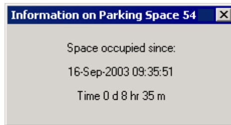
Figure 3: An SNMP alert

Through this higher level of automation and use of an IP-based network architecture, Amersam can monitor and control all of its parking facilities in Reus from a centralized control center. This means that it is no longer necessary to have all facilities manned 24 hours to avoid compromising customer service. "The resulting savings in staffing alone have more than justified the costs of installing and implementing the Opto 22 M2M technology," says Blazquez.