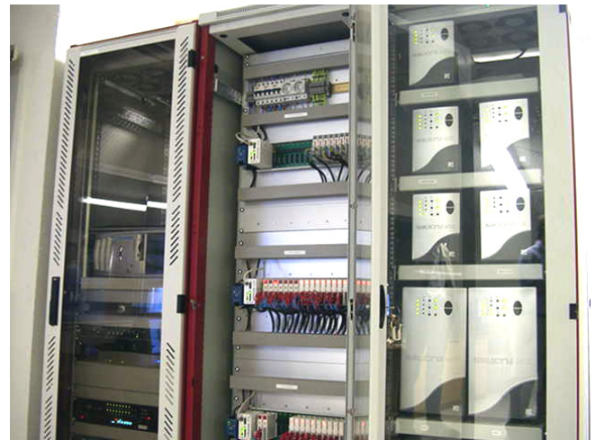
Figure 2: Opto 22 hardware communicates with Amersam's facility systems via standard wired and wireless Ethernet connections.

Avoiding proprietary solutions, such as field buses and exclusive software packages, all sensors and monitoring systems in the Amersam parking structures are connected to Machine-to-Machine communication (M2M) systems from Opto 22 of Temecula, California, USA. Opto 22, a developer and manufacturer of hardware and software for automation, remote monitoring, and data acquisition applications, bases its M2M systems on its SNAP Ultimate I/O hardware. Unlike most programmable logic controllers (PLCs), which are sometimes used for M2M-type applications, SNAP Ultimate I/O is a programmable system with built-in Ethernet capabilities, allowing data to be accessed by or transmitted to any point on an Ethernet TCP/IP network.