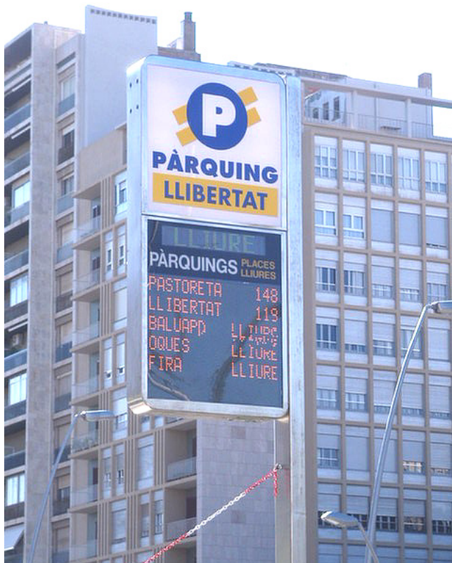
Figure 4: Public information panels at street level connect directly to SNAP Ultimate I/O and display current parking availability.

TCM Enginy, working with Amersam, has leveraged its new capabilities, enabled by implementation of the Opto 22 M2M technology, to solve specific customer service issues. A major complaint from users of the Amersam parking structures was that upon arriving at a location that was full, their only choices were to queue outside (with their car's engine and air conditioner running) or drive to another facility in hope of finding a space. With information on parking availability now residing on their network, Amersam decided to make the data available to the public via the Internet. With minimal software development Amersam and TCM Enginy created a Web portal that customers can access to check the status of all Amersam parking facilities.