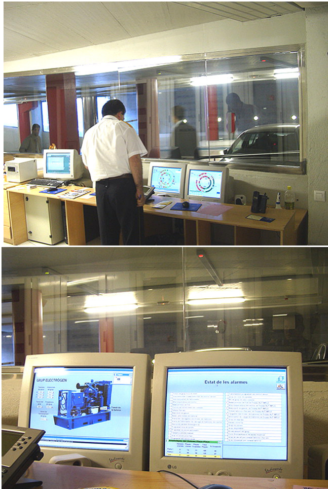
Figures 6 and 7: Amersam management remotely monitoring facility parking spaces and equipment.