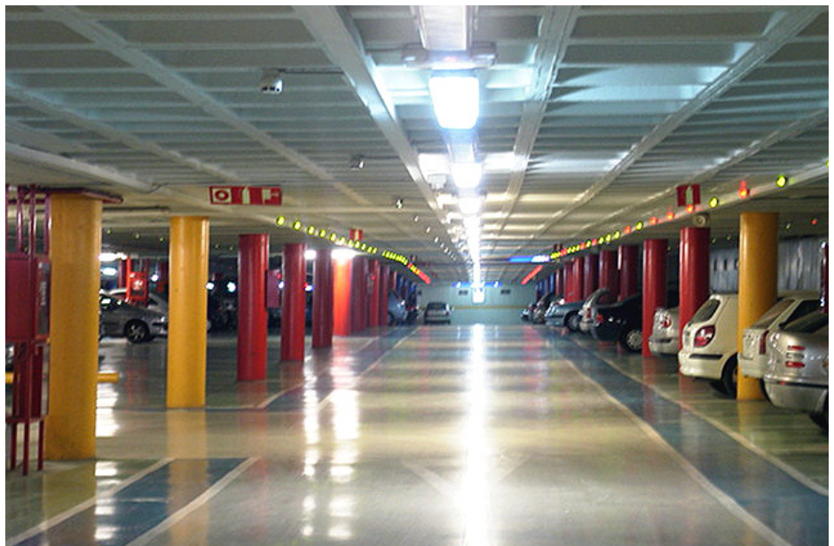
Figure 1: Interior of an Amersam parking facility

All public parking facilities in Spain are required to maintain a host of general services and also monitor for fire, carbon monoxide, and other hazardous conditions. Typically, each of these