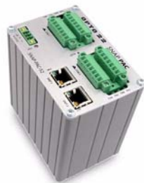
A PAC with multiple network interfaces reduces hardware costs.

The PAC shown at right, for example, includes two independent Ethernet network interfaces plus four serial ports configurable for RS-232 or RS-485/422.