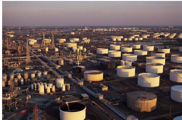
PACs efficiently handle extensive systems, because they combine distributed control and remote communication options.

Is your system distributed over a broad area? Do you need to monitor assets in remote locations? Because PACs combine distributed control with remote communication options, they can efficiently handle extensive systems with remote installations.