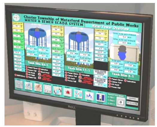
HMI screens were developed to give Waterford personnel visual representations of equipment and processes and point-and-click control capabilities.

This and other improvements have created tremendous cost savings for the township. Since 1996, Waterford's water system has grown over 20%, while simultaneously energy costs have skyrocketed. However, over this same period, the total pumping and treatment energy budget has increased by only $62,000, from $450,000 per year to $512,000 annually. The sewer pumping energy budget has seen similar efficiencies, with the energy budget increasing by only $4,000 since 1996, from $68,000 to $72,000 annually.