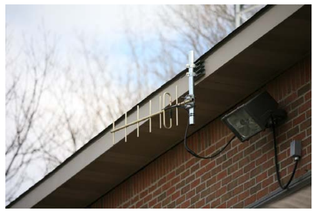
Automated meter reading and other communications capabilities are enabled through the township's broadband wireless network.

The Waterford DPW's advanced monitoring capabilities and very high levels of automation have gained