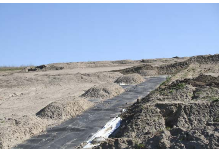
Bunds like this help keep landfill runoff contained so it doesn't contaminate the surrounding area.

lagoon and the remote wells, and automate decisions like whether or not well contents can be pumped to the lagoon. For example, the SNAP PAC provides a voltage output to inverters (aka variable speed drives) to set pump speeds. Different voltages are used to slow down or speed up the pumps based on conditions in the lagoon and remote wells. When levels are within acceptable tolerances, the control system automatically slows down processing. This not only optimizes operations, but also extends the lifespan of the landfill's expensive pumping equipment.