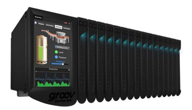
groov View HMI