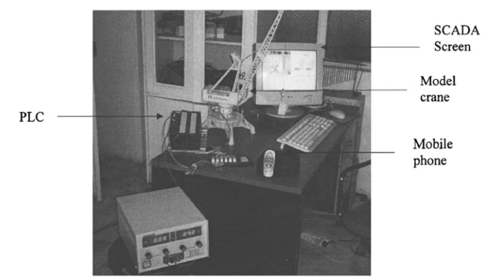
Early experiment using mobile in automation<sup>7</sup>

Mobile adoption in automation has been slower than in other fields, though enthusiasm began early. In 2004, two researchers from Turkey theorized that mobility could make workers in industry more productive. Their proof of concept? They used a mobile phone to control a model crane using a SCADA system.<sup>7</sup>