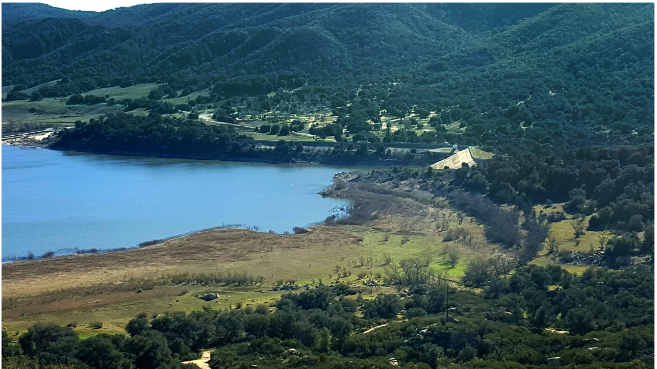
Vista Irrigation District sources a portion of its water supply from Lake Henshaw in San Diego County, California.

In February 1954, the District joined the San Diego County Water Authority so that it would have the option to receive water imported from northern California and the Colorado River. Since then the District has persevered through droughts and economic fluctuations while supporting a massive shift from a predominantly agricultural to a more economically diverse community.