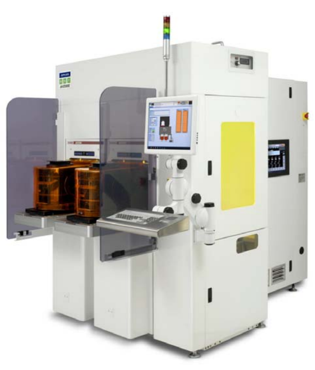
AMST's MVD300 molecular vapor deposition system

EFEMs are the mainstay of semiconductor manufacturing automation and are responsible for shuffling product