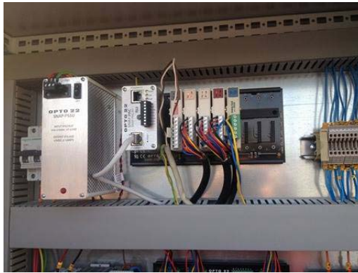
The compact Opto 22 SNAP PAC System

One of the challenges FB Group faced in automating the solar plant was integrating serial data from ABB data loggers. Designed into the PV system to monitor PV performance, the data loggers require an RS-485 interface to connect to a control system.