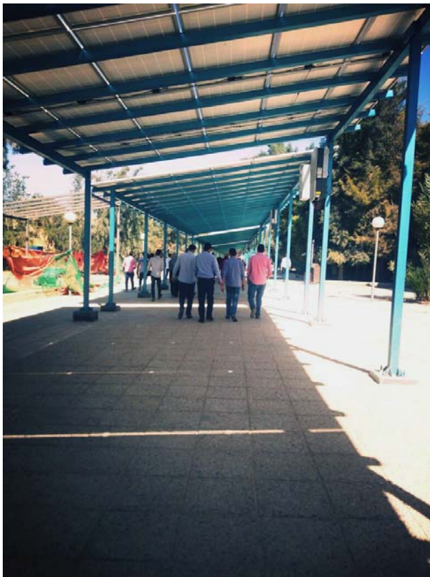
A 616 kW canopy system throughout the campus also provides welcome shade for pedestrians.

At its completion, the solar farm delivered enough electricity to power the entire university, resulting in a total electricity bill of 1 JOD since July 2016.