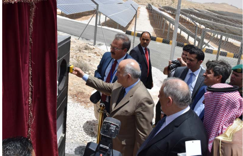
Opening ceremony for the university's solar system

"The project was launched with a huge opening ceremony under the patronage of his royal highness Prince El Hassan Bin Talal, the uncle of His Majesty King Abdullah II."