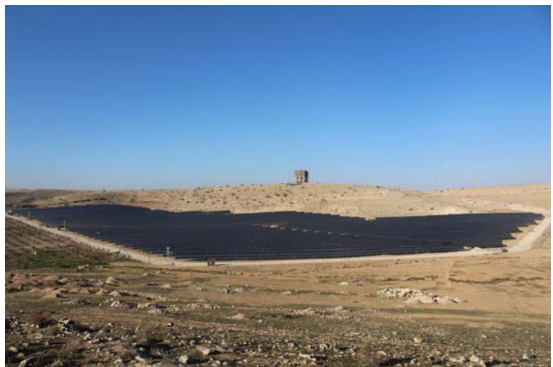
A 4 MW ground array provides the majority of the university's energy requirements.