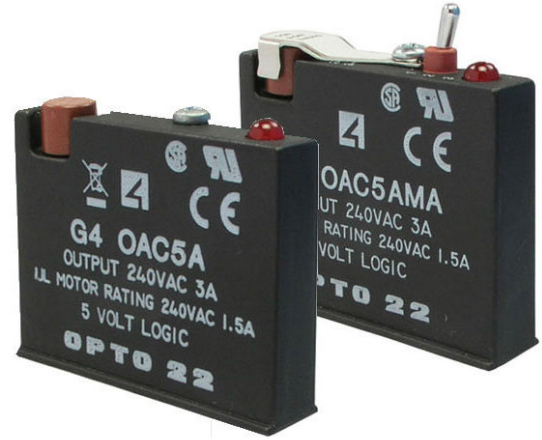
G4OAC5A and G4OAC5AMA Modules