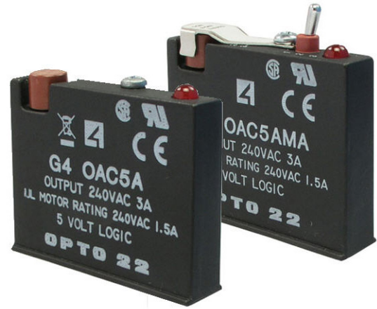
G4OAC5A and G4OAC5AMA Modules