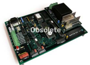
AC31B - Obsolete

The slave side of the interface is either RS232 or RS485/422.