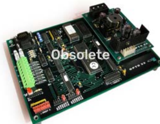
AC31C - Obsolete

*** NOTE: AC31A and AC31B are obsolete and no longer available when current stock is depleted. AC31C is obsolete and no longer available ***