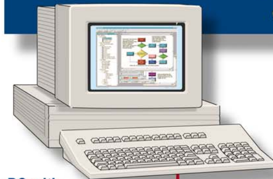
PC with FactoryFloor