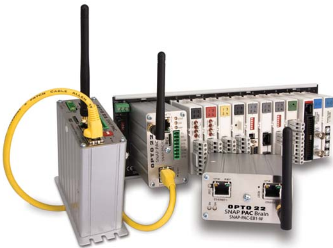
Opto 22 wired/wireless SNAP programmable automation controllers and SNAP I/O

For more information on wireless I/O and other products, visit www.opto22.com or contact Opto 22 Pre-Sales Engineering.