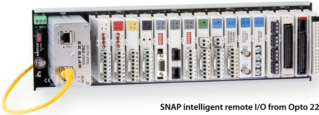
SNAP intelligent remote I/O from Opto 22

Functions that take the most processing power typically involve the heavy analog signal processing required by most process control applications. If remote I/O processors include built-in capabilities like ramping, thermocouple linearization, filtering a noisy signal, analog scaling, and minimum/maximum values, the main controller can focus on supervision and overall control. And your employees can tackle more interesting projects.