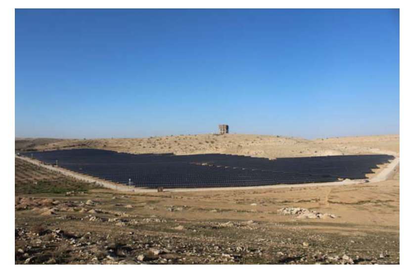
A 4 MW ground array provides the majority of the university's energy requirements.