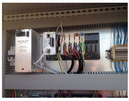
The compact Opto 22 SNAP PAC System

The SNAP-PAC-R1 includes two independent, 10/100 Mbps Ethernet network interfaces. Each interface has a separate IP address, so the PAC can be used to segment the control network from the company IT network,