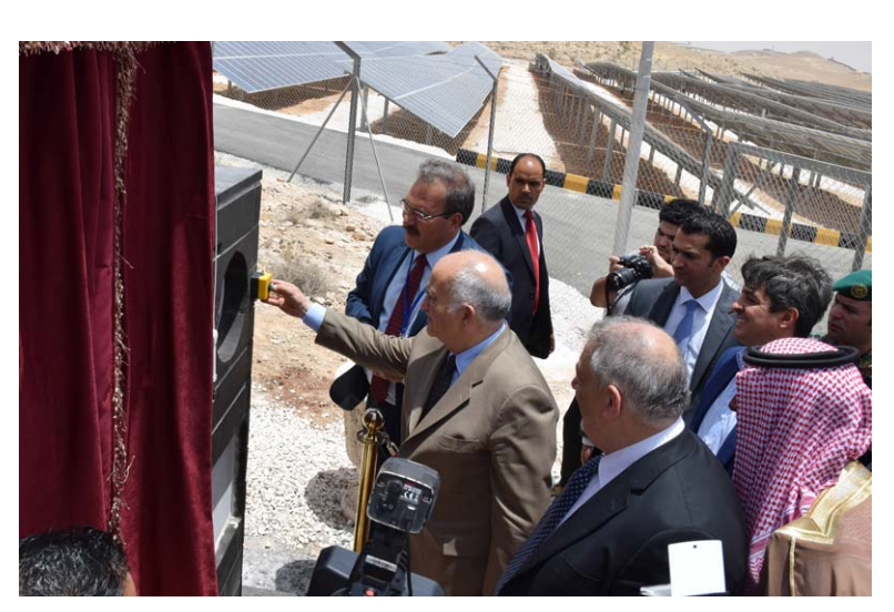
Opening ceremony for the university's solar system

"The project was launched with a huge opening ceremony under the patronage of his royal highness Prince El Hassan Bin Talal, the uncle of His Majesty King Abdullah II."